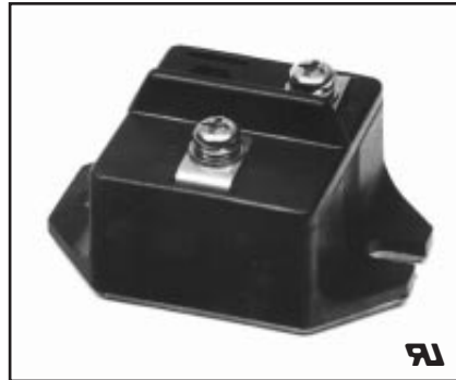
CS240610, CS241210 Fast Recovery Single Diode Modules 100 Amperes/600-1200 Volts