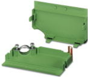
Cable housing, Pitch: 5 mm, Number of positions: 16, Dimension a: 80 mm, Color: green

Please be informed that the data shown in this PDF Document is generated from our Online Catalog. Please find the complete data in the user's documentation. Our General Terms of Use for Downloads are valid ( http://download.phoenixcontact.com )