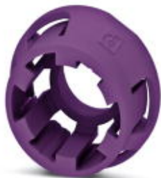
Fixing sleeve for M12 housing screw connection with tolerance-compensating function, for SMD-solderable M12 socket contact inserts.

Please be informed that the data shown in this PDF Document is generated from our Online Catalog. Please find the complete data in the user's documentation. Our General Terms of Use for Downloads are valid ( http://phoenixcontact.com/download )