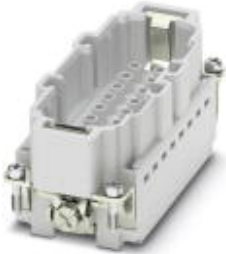
HEAVYCON pin insert, for 830 V (III/3), with 6 N/O contacts and 2 switch contacts, crimp connection

Please be informed that the data shown in this PDF Document is generated from our Online Catalog. Please find the complete data in the user's documentation. Our General Terms of Use for Downloads are valid ( http://phoenixcontact.com/download )