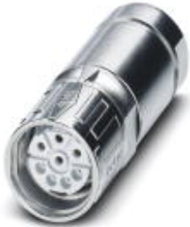
Cable connector, SPEEDCON locking, M23, Number of positions: 5+PE, Type of contact: Socket, Crimp connection, shielded: yes, Cable diameter: 7.5 mm...18 mm

Please be informed that the data shown in this PDF Document is generated from our Online Catalog. Please find the complete data in the user's documentation. Our General Terms of Use for Downloads are valid ( http://phoenixcontact.com/download )