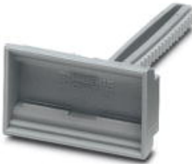
Terminal strip markers, gray, Unlabeled, Mounting type: Plug in, Lettering field: 20 mm x 8 mm

Please be informed that the data shown in this PDF Document is generated from our Online Catalog. Please find the complete data in the user's documentation. Our General Terms of Use for Downloads are valid ( http://download.phoenixcontact.com )