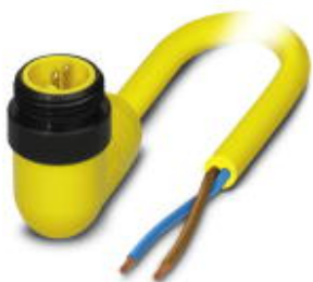
Power cable, 2-position, PVC, yellow, Plug angled 7/8"-16UNF, A - standard, on free cable end, cable length: 10 m

Please be informed that the data shown in this PDF Document is generated from our Online Catalog. Please find the complete data in the user's documentation. Our General Terms of Use for Downloads are valid ( http://phoenixcontact.com/download )