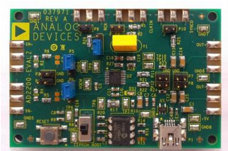
Figure 1. ADA2200-EVALZ Evaluation Board

The ADA2200-EVALZ is the simpler of the two evaluation boards. It facilitates signal connections to standard test equipment. The part can be reconfigured with the use of the on-board EEPROM.