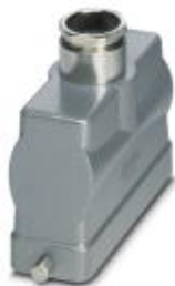
HEAVYCON B24 sleeve housing, for single locking latch, height: 76 mm, with 1 x Pg29 screw connection, straight cable outlet

Please be informed that the data shown in this PDF Document is generated from our Online Catalog. Please find the complete data in the user's documentation. Our General Terms of Use for Downloads are valid ( http://phoenixcontact.com/download )