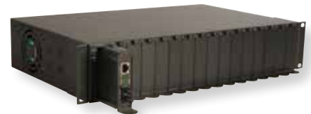
Media Converter 19" 2U Rack Chassis, 6 Slots Model# EIS-RACK-16

Desk or wall mount as stand-alone products or install into available 19-inch rack chassis system. The chassis system supports hot-swap installation of media converters, Ethernet extenders, and redundant power supplies to power up to 16 media converters and extenders.