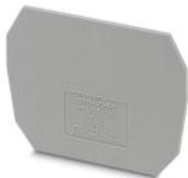
End cover, length: 40 mm, width: 1.1 mm, height: 28.9 mm, color: gray

Please be informed that the data shown in this PDF Document is generated from our Online Catalog. Please find the complete data in the user's documentation. Our General Terms of Use for Downloads are valid ( http://phoenixcontact.com/download )