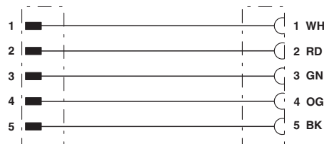
Contact assignment of 7/8" plug