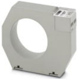
Differential current converter for type A differential current monitor.

Please be informed that the data shown in this PDF Document is generated from our Online Catalog. Please find the complete data in the user's documentation. Our General Terms of Use for Downloads are valid ( http://phoenixcontact.com/download )