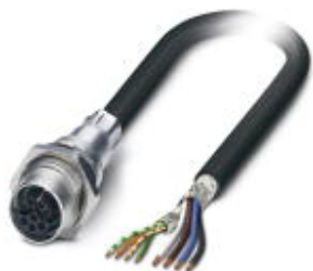
Hybrid flush-type socket, Ethernet, 8-pos., M12-SPEEDCON, rear/screw mounting with M16 thread, 360° shield connection with connected shielded hybrid cable

Please be informed that the data shown in this PDF Document is generated from our Online Catalog. Please find the complete data in the user's documentation. Our General Terms of Use for Downloads are valid ( http://phoenixcontact.com/download )