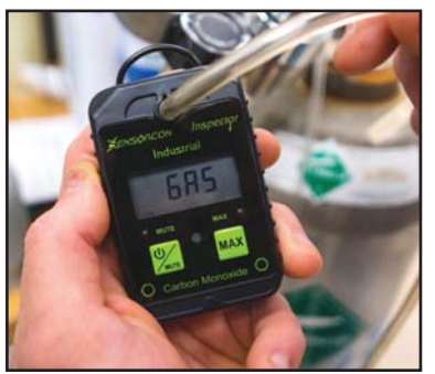
Connect the 50ppm calibration gas.