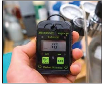
Wait for the countdown to complete.