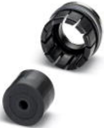
Unshielded cable clamp type cage, shielded: No, Cable diameter: 2 mm...10.5 mm

Please be informed that the data shown in this PDF Document is generated from our Online Catalog. Please find the complete data in the user's documentation. Our General Terms of Use for Downloads are valid ( http://phoenixcontact.com/download )