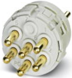
Contact insert, Number of positions: 6, Type of contact: Male connector, Solder-in connection

Please be informed that the data shown in this PDF Document is generated from our Online Catalog. Please find the complete data in the user's documentation. Our General Terms of Use for Downloads are valid ( http://phoenixcontact.com/download )