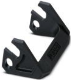
Replacement single locking latch for HEAVYCON EVO housing type B10, PA

Please be informed that the data shown in this PDF Document is generated from our Online Catalog. Please find the complete data in the user's documentation. Our General Terms of Use for Downloads are valid ( http://phoenixcontact.com/download )