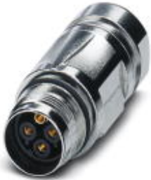
Coupler connector, straight, SPEEDCON locking, M17, Number of positions: 5+3+PE, Type of contact: Socket, Crimp connection, shielded: yes, Cable diameter: 10 mm...12.5 mm

Please be informed that the data shown in this PDF Document is generated from our Online Catalog. Please find the complete data in the user's documentation. Our General Terms of Use for Downloads are valid ( http://phoenixcontact.com/download )