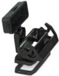
HEAVYCON EVO panel mounting base, plastic, D25, with single locking latch, flat gasket, and protective cover

Please be informed that the data shown in this PDF Document is generated from our Online Catalog. Please find the complete data in the user's documentation. Our General Terms of Use for Downloads are valid ( http://phoenixcontact.com/download )