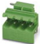
Header, Nominal current: 12 A, Rated voltage (III/2): 320 V, Number of positions: 4, Pitch: 5 mm, Assembly: Soldering, Article with lateral pin exit