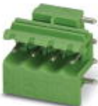
Header, Nominal current: 12 A, Rated voltage (III/2): 320 V, Number of positions: 4, Pitch: 5 mm, Assembly: Soldering, Article with lateral pin exit