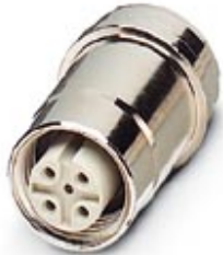
Sensor/actuator flush-type socket, 4-pos., M12, A-coded, front/press-in mounting, with straight solder connection

Please be informed that the data shown in this PDF Document is generated from our Online Catalog. Please find the complete data in the user's documentation. Our General Terms of Use for Downloads are valid ( http://download.phoenixcontact.com )