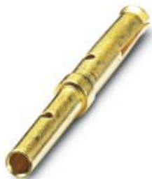
D-SUB crimp contact, connection method: Crimp connection, connection cross section: AWG 28- 22, High Density

Please be informed that the data shown in this PDF Document is generated from our Online Catalog. Please find the complete data in the user's documentation. Our General Terms of Use for Downloads are valid ( http://phoenixcontact.com/download )