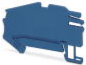
Support bracket, Bracket for busbars, set every 20 cm, Length: 67 mm, Width: 2 mm, Height: 43 mm, Color: blue