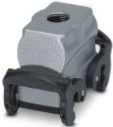
HEAVYCON B10 coupling housing, with double locking latch, height: 62 mm, with 1 x M20 thread, straight cable outlet

Please be informed that the data shown in this PDF Document is generated from our Online Catalog. Please find the complete data in the user's documentation. Our General Terms of Use for Downloads are valid ( http://phoenixcontact.com/download )