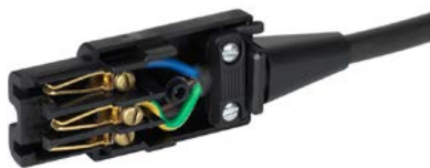
Example with assembled cable