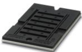
The figure shows version

Magazine for the THERMOMARK PRIME printer, for accommodating UCT-EM (17.5x9)