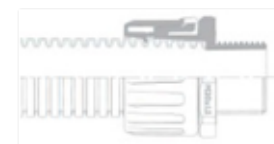
Conduit complete with FPA fitting