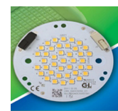
LED Down Lighting