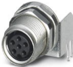
Sensor/actuator flush-type plug-in connector, socket, 6-pos., M8, rear/screw mounting with M10 fastening thread, with angled solder connection

Please be informed that the data shown in this PDF Document is generated from our Online Catalog. Please find the complete data in the user's documentation. Our General Terms of Use for Downloads are valid ( http://download.phoenixcontact.com )