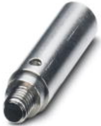
Female test connector, for 4 mm test plugs, for screwing into the bridge shaft, color: silver

Please be informed that the data shown in this PDF Document is generated from our Online Catalog. Please find the complete data in the user's documentation. Our General Terms of Use for Downloads are valid ( http://phoenixcontact.com/download )