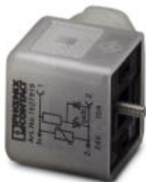
Valve connectors, 3-position, Valve connector A, with 1 LED, connected with Varistor, Screw connection, cable gland Pg9, external cable diameter 6 mm ... 8 mm

Please be informed that the data shown in this PDF Document is generated from our Online Catalog. Please find the complete data in the user's documentation. Our General Terms of Use for Downloads are valid ( http://phoenixcontact.com/download )