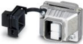
SCRJ push-pull coupling

SCRJ push-pull coupling, IP67, metal, with protective cover, color: nickel-plated