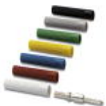
Insulating sleeve, Color: yellow