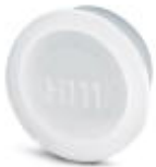
Plastic dust protection cap for connectors with M23 knurled nuts

Plastic dust protection cap - RC-Z2058 - 1604223